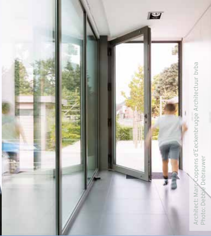
Architect: Marc Coppens d'Eeckenbrugge Architectuur bvba