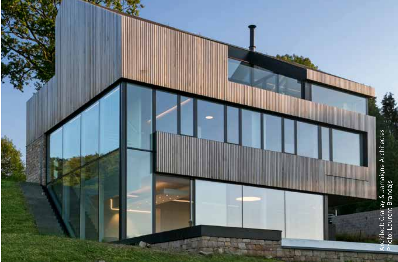
Architect: Crahay & Jamaigne Architectes